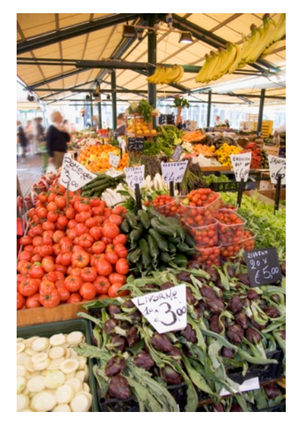
This is a Market