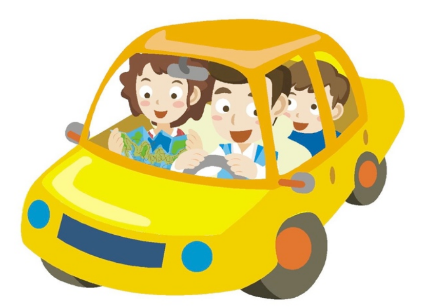
This Car Belongs to Us