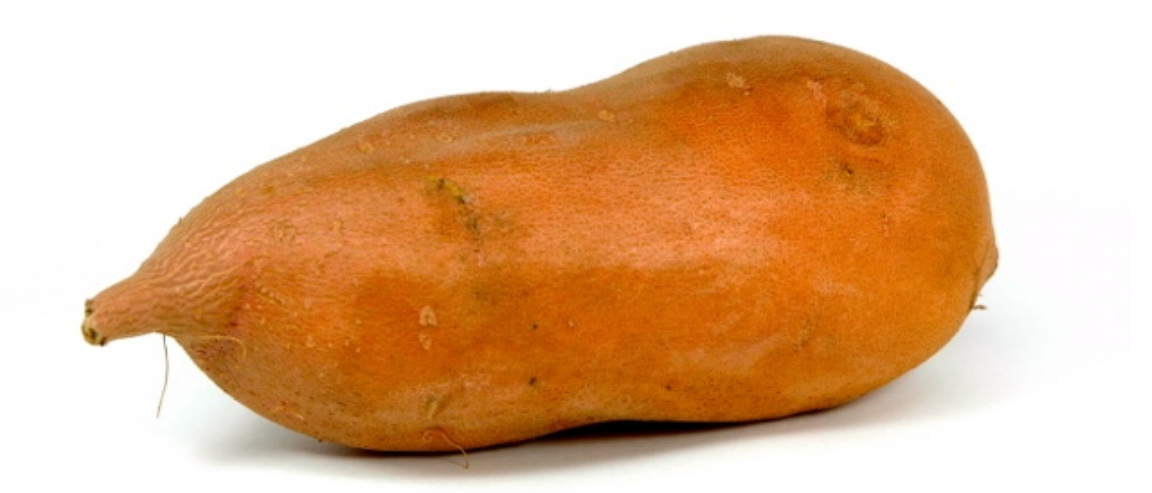
This is a Yam

This is a yam. I will soon eat this yam.