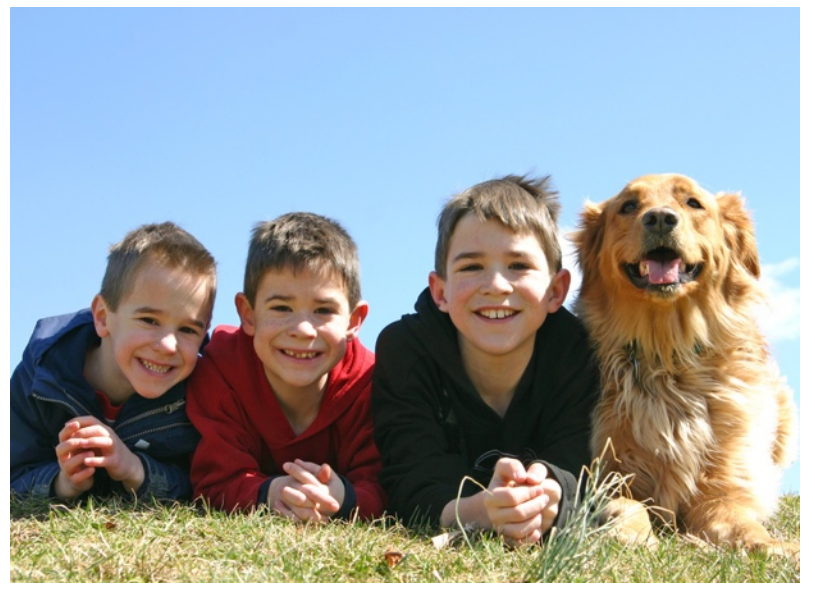
This Dog Belongs to Us