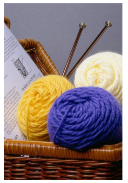
This is Yarn