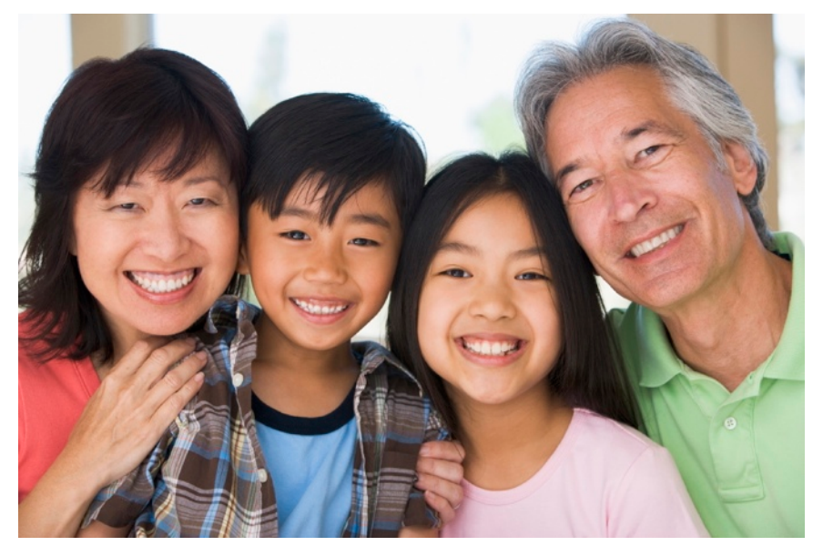
My Grandmother and Grandfather

My sister and I are with my grandmother and grandfather.