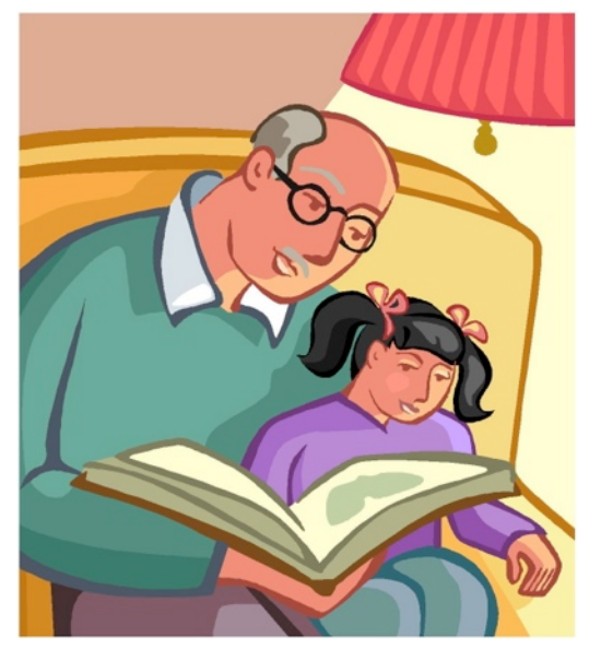
My Grandfather and I Read

Yesterday, my grandfather and I got ten books that we wanted to read.